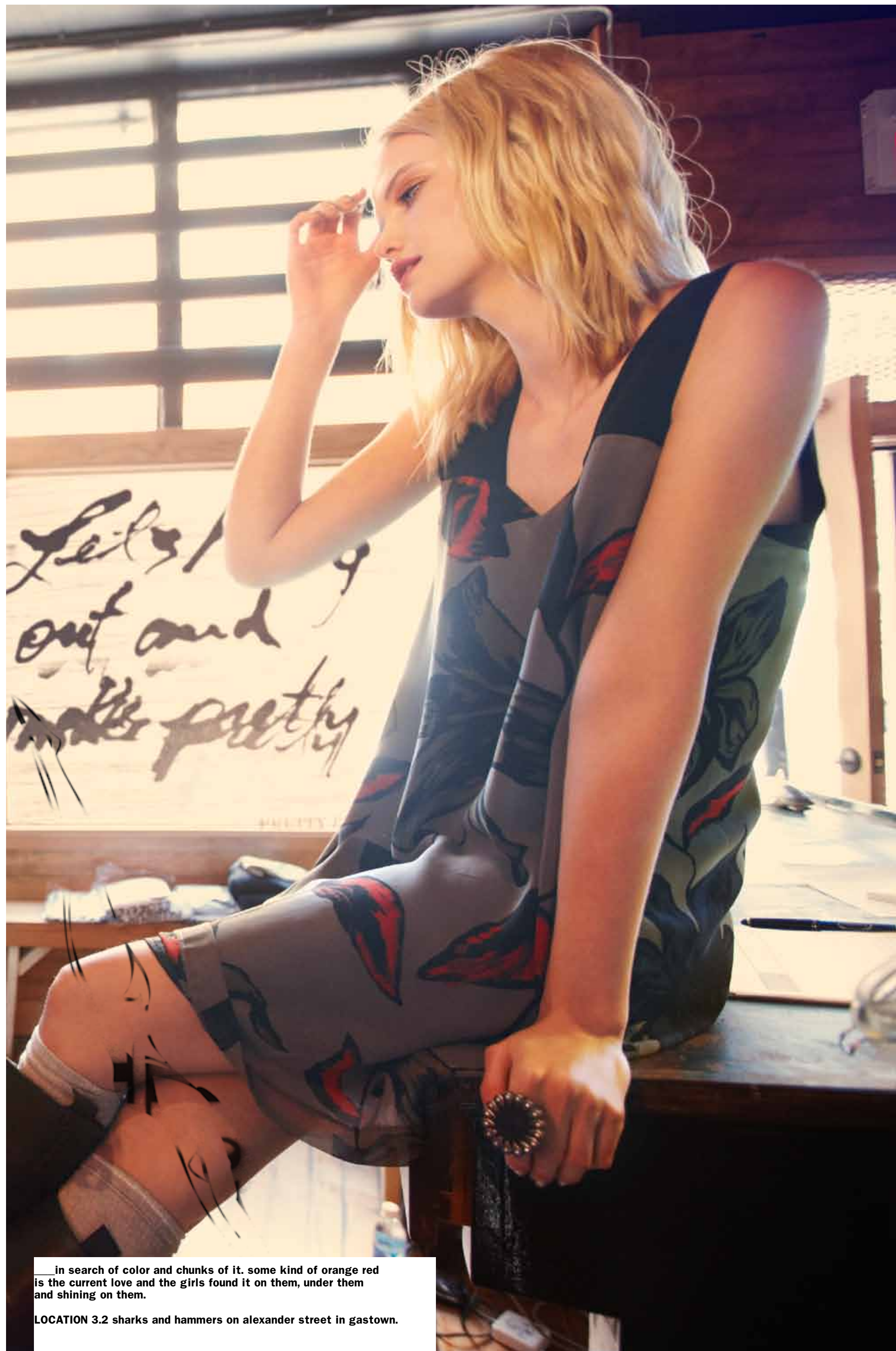
____ in search of color and chunks of it. some kind of orange red is the current love and the girls found it on them, under them and shining on them. LOCATION 3.2 sharks and hammers on alexander street in gastown.